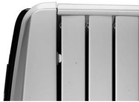
NEW BATTERY DESIGN

New Battery Design, with enlarged fins shape, which allows to increase the chimney effect and to have a faster airflow emission.