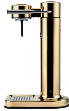
Carbonator II Product No: AA01 Color: Brass