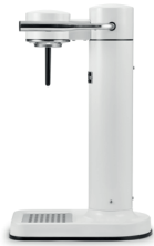
Carbonator II Product No: AA01 Color: White