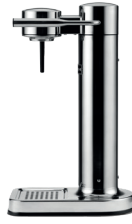
Carbonator II Product No: AA01 Color: Polished Steel

Compatible with 60L (425 g) CO2 cylinders from all major brands (Sodastream, AGA, Linde etc.).