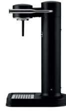
Carbonator II Product No: AA01 Color: Black