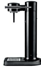
Carbonator II Product No: AA01 Color: Black Chrome