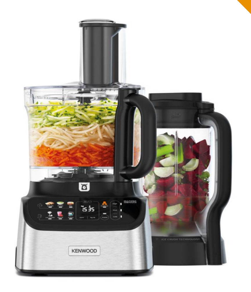
Preset Recipes at kenwoodworld.com